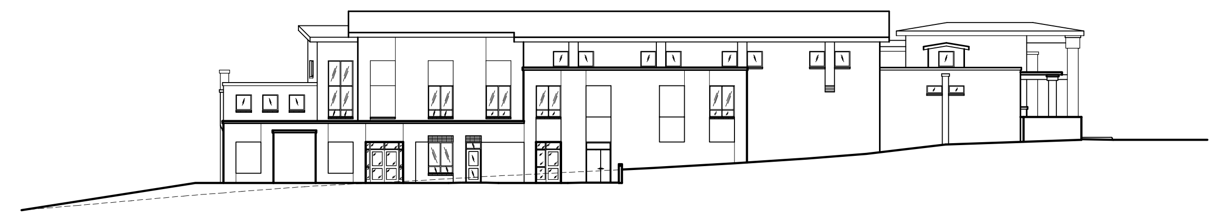
3 NORTH ELEVATION ASB 1"=20'