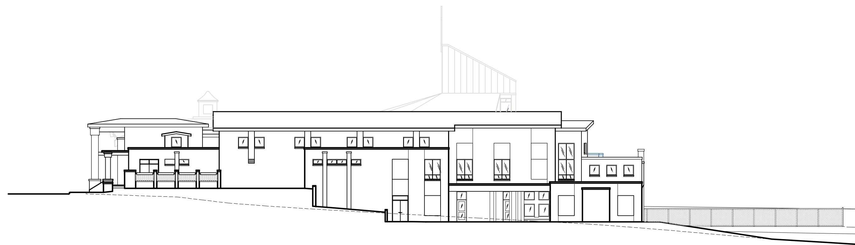
2 SOUTH ELEVATION ASB 1"=20'